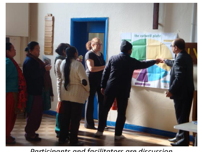
Participants and facilitators are discussion about food nutrition

Liver is a good source of iron. However, be careful how much liver you eat as it's also rich in vitamin A, too much of which can be harmful.